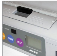
Top Cover Opening for Easy Media Load