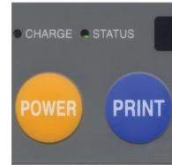
Large Operator Control Buttons