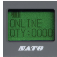
Large LCD Display (802.11 b/g model)