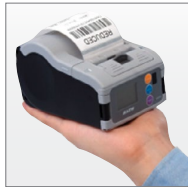
Small & Light Durable & Dependable

Quick and Durable. Ultimate Performance and Mobility.